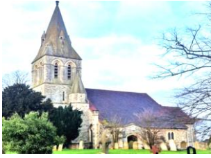
St. Andrew's Church Wraysbury