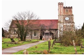
St. Michael's Church Horton